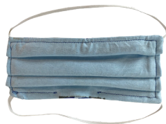
Double Sheet Cotton Cover (No Printing / color fabric as available) (Discounts for Volume Orders)