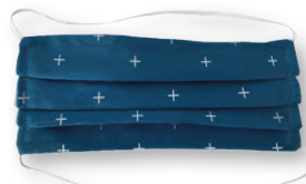
Single Sheet Polyester Cover with Single Sheet Cotton Barrier & Filter Pocket (Discounts for Volume Orders)